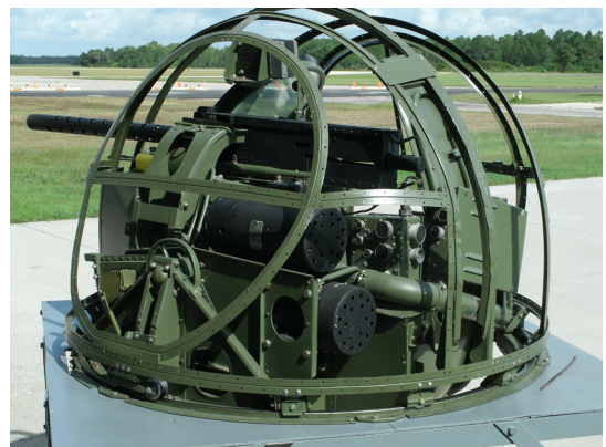
The same turret after restoration