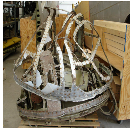
The Ball Turret before restoration