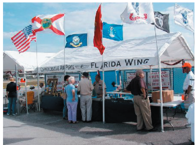
Our PX and the T-28 at the Stuart Air Show Last Year

Our unit needs additional pilots. We have two flying L-17 Navion airplanes and need to recruit additional sponsors to fly those planes so that when the opportunity presents itself we can respond. We get a number of requests to do a formation fly-over for various civic, memorial, veterans and service functions. We ask owners of personal aircraft to participate in the name of the Commemorative Air Force and have been successful in keeping the CAF name in front of the public. The number of planes available for service has been reduced as owners sell their planes because of the high cost of operation. That makes it difficult to even muster a 4 ship which is necessary for a missing man formation. We will continue to provide these flights, as a service, for veterans and other patriotic groups. Probably the last air show for 2008 is scheduled for November 7-9 at Stuart, Florida. Our members have been invited to attend this show for the past 7 years and we usually are allowed to bring our PX to this event. We look forward to a better 2009.