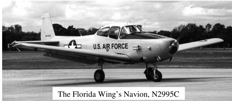
The Florida Wing's Navion, N2995C