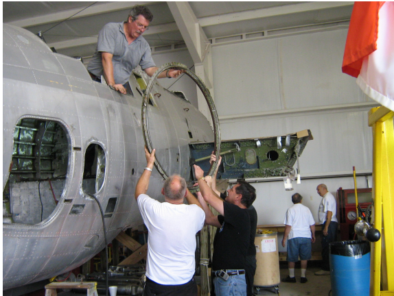
Removal of the turret ring