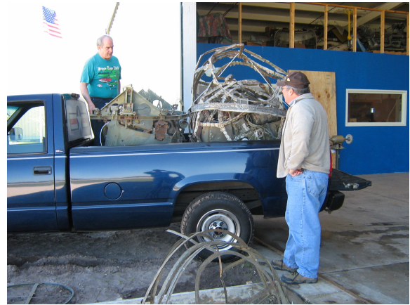
TBM turret loaded to go for rebuild